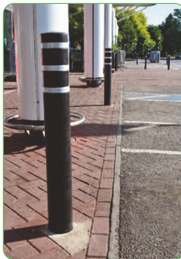
Impact Flex TR130